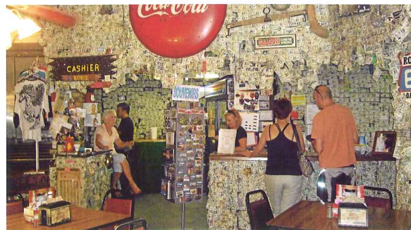
The Million Dollar Bar, Oatman. Sign your dollar, stick it on the wall with the rest of them.