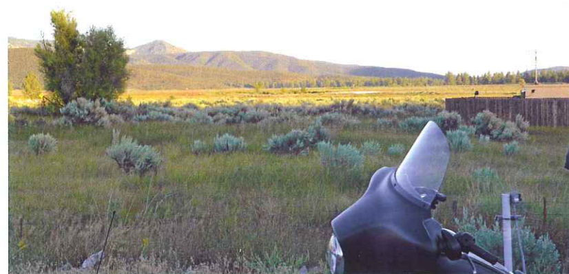
There's two more hours of sunlight and 80 miles of twists and turns to go. Best get on with it.