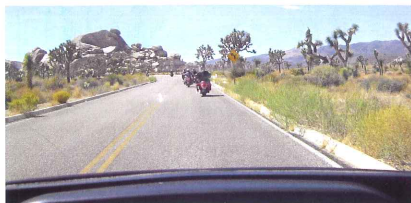
View from the support truck – Joshua Tree Park again.

Twenty minutes after you leave, the difference between what you paid and what you actually used is refunded to your card. In California there's the extra fun of vapour-free nozzles which need to be pressed into a car filler to activate the pump. Do this on a bike and you'll only fill two thirds of the tank, so you have to hold the pump in one hand and pull the vapour lock switch back with the other. Maybe it's just me, but all I could think, every time, was... er... foreskin. Sorry for that image if you're eating while reading this.